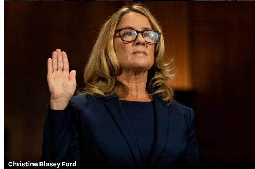
Christine Blasey Ford