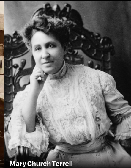
Mary Church Terrell