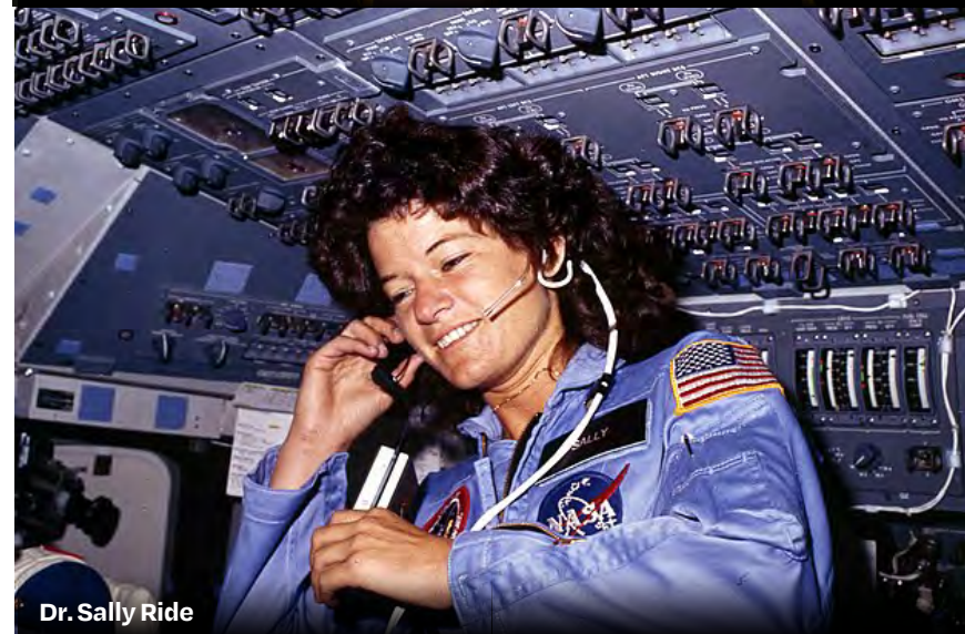
Dr. Sally Ride