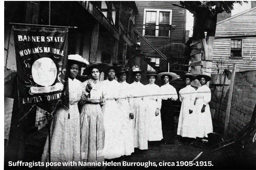
Suffragists pose with Nannie Helen Burroughs, circa 1905–1915.