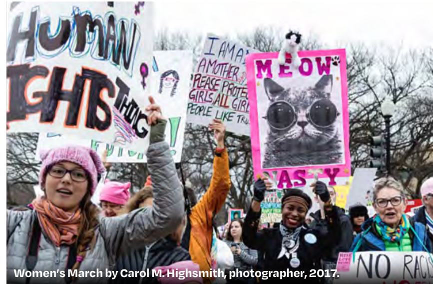
Women's March