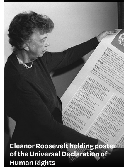
Eleanor Roosevelt holding poster of the Universal Declaration of Human Rights