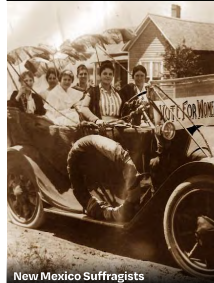
New Mexico Suffragists