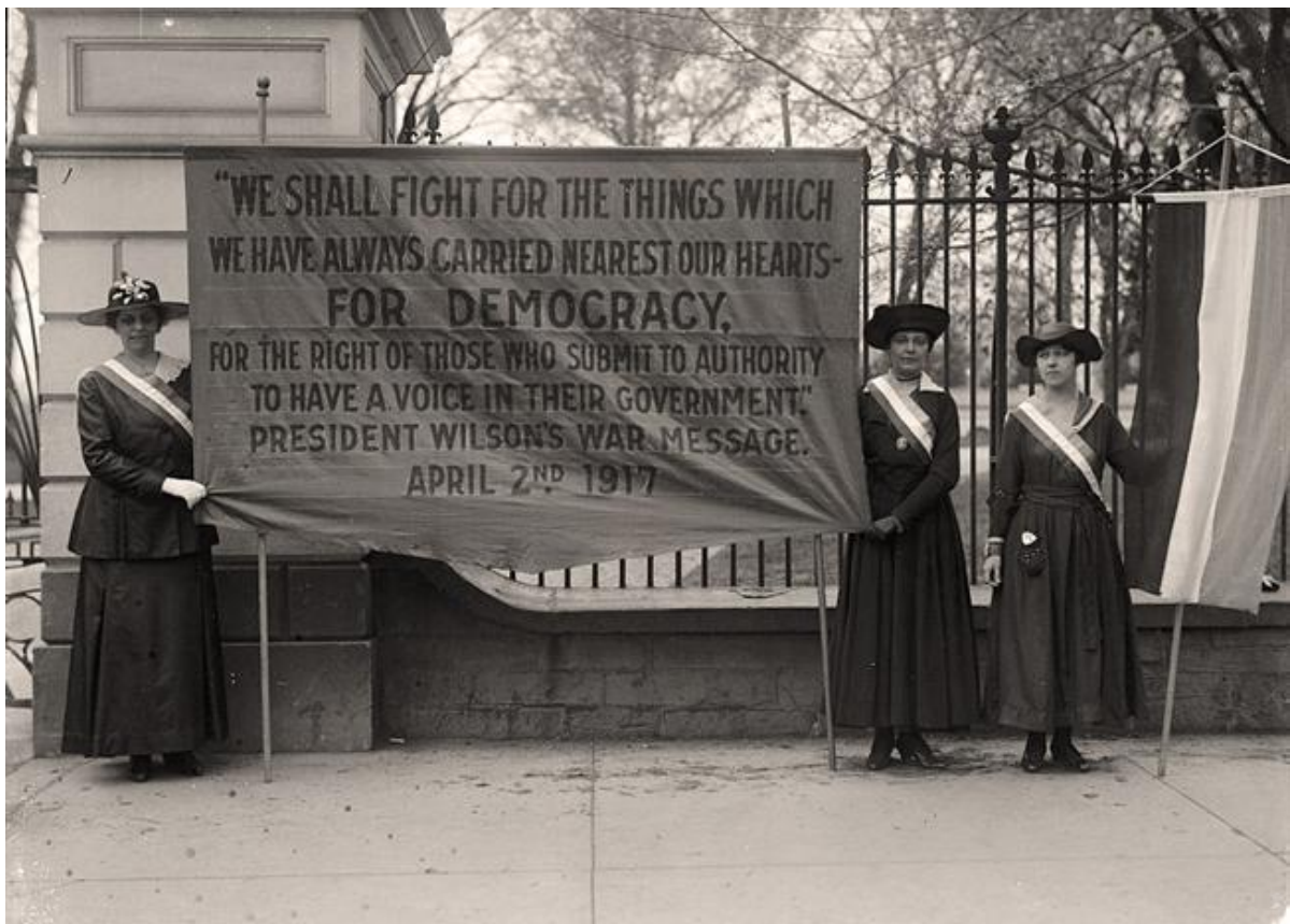
SUFFRAGISTS FROM NATIONAL WOMAN'S PARTY (NWP) PICKETING THE WHITE HOUSE c. 1917

STOP AND ANSWER GUIDING QUESTIONS FOR PHASE 1.